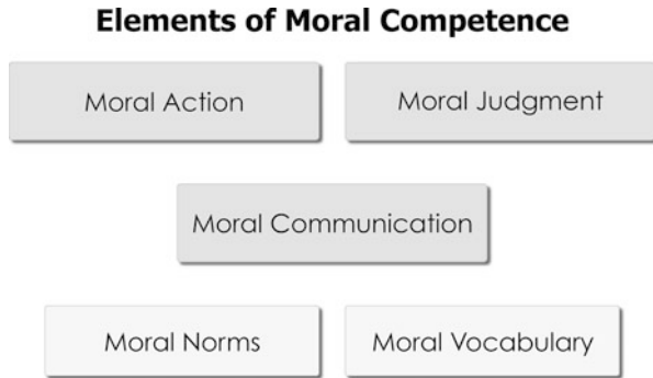
Fig. 1 Five elements of moral competence, which can be divided into constituents (lower two) and activities (upper three)