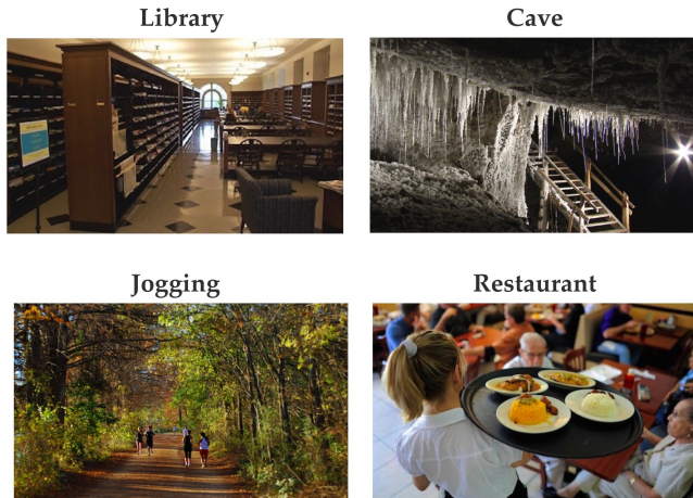
Figure 1: Four sample scene pictures used to elicit norms

(Permissions), or is “not allowed” to perform (Prohibitions), or is “supposed” to perform (Prescriptions). This between-subjects manipulation of norm type was constant across pictures so that each participant answered the same question (e.g., “What are you permitted to do here?”) for all four pictures they encountered.